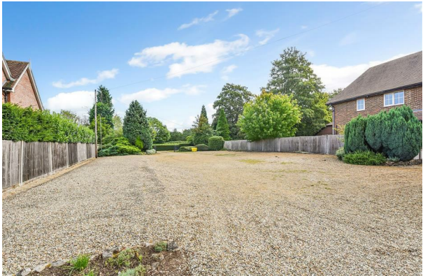
Kingdom Hall Stockbridge Road | £495,000 Timsbury, Romsey, Hampshire, SO51 0NG